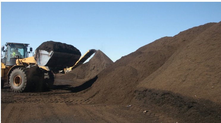
Recology's Ostrom Road Landfill & Compost Facility