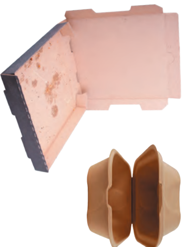
UNCOATED SOILED PAPER, AND BI-CERTIFIED COMPOSTABLE BAGS