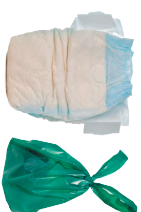
DIAPERS AND PET WASTE