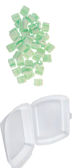
PACKAGING FOAM AND POLYSTYRENE