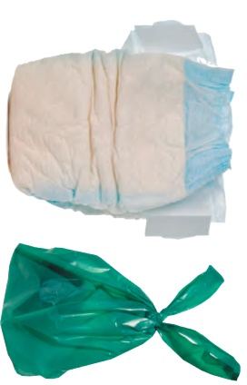
DIAPERS AND PET WASTE