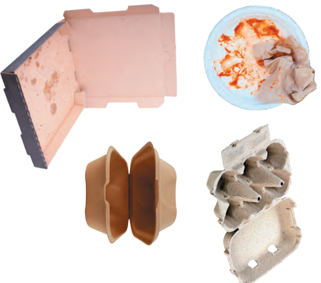
UNCOATED SOILED PAPER, AND BPI-CERTIFIED COMPOSTABLE BAGS