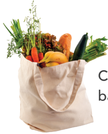
Canvas grocery bags