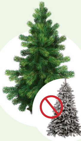
NO FLOCKED TREES

Drop-off available at Bolinas-Stinson Resource Recovery Project at 25 Olema Bolinas Rd, Mon - Sat, 9am - 5pm. Trees must be unflocked with metal stakes removed. Trees can also be cut to fit inside your green cart, with the lid closed, for collection on any of your regular service days.