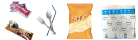
✓ SINGLE USE PLASTICS