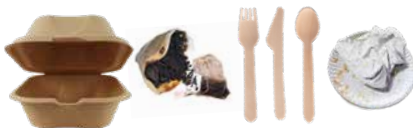
✓ UNCOATED SOILED PAPER AND WOODEN UTENSILS