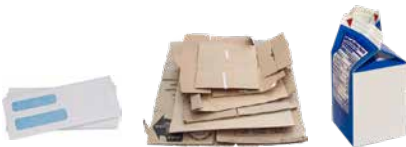
✓ CLEAN PAPER PRODUCTS, CARTONS, AND CARDBOARD

Looking to properly recycle a mattress, tires, carpet, or e-waste? Check out Conservation Corps North Bay's new drop off location in Santa Rosa, at 3555 Airway Drive. Find out more at ccnorthbay.org .