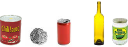
✓ METALS ✓ GLASS