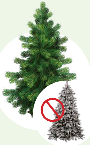
NO FLOCKED TREES

Curbside collection of holiday trees will take place Jan 6th - 17th on your service day. After these dates, trees can be cut to fit inside your green cart, with stakes removed, for collection on your regular service day. Drop-off available: Rohnert Park Community Center at 5401 Snyder Lane, Dec 26th - Jan 17th.