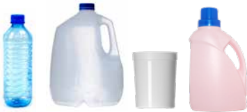
✓ PLASTIC BOTTLES, TUBS, AND JUGS