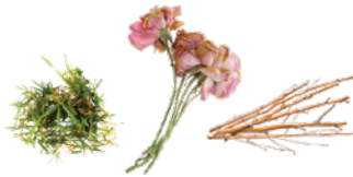
✓ PLANT TRIMMINGS