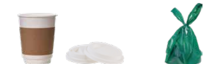
✓ COFFEE CUPS ✓ PET WASTE