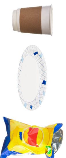
SNACK BAGS, WRAPPERS, AND COATED PAPER PRODUCTS