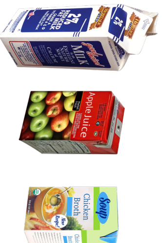
CARTONS AND ASEPTIC PACKAGING