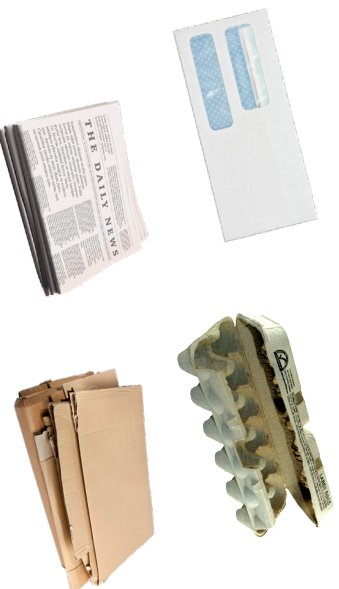
CLEAN PAPER AND CARDBOARD