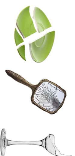
CERAMICS AND MISC. GLASS