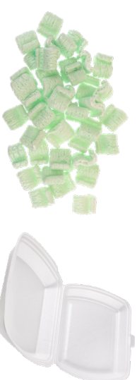
PACKAGING AND POLYSTYRENE FOAM