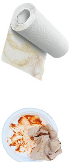
UNCOATED FOOD-SOILED PAPER PRODUCTS