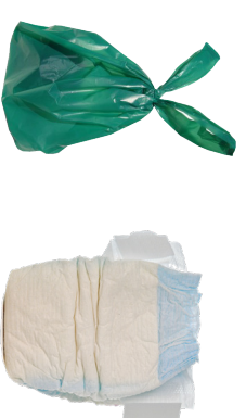
BAGGED ANIMAL WASTE AND DIAPERS