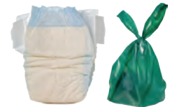
DIAPERS AND PET WASTE