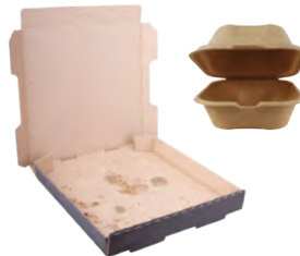
UNCOATED SOILED PAPER