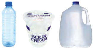
PLASTIC BOTTLES, TUBS, AND JUGS