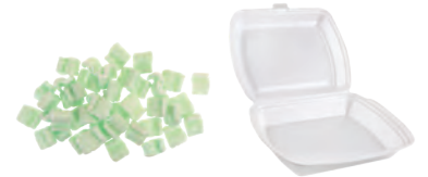
PACKAGING FOAM AND POLYSTYRENE