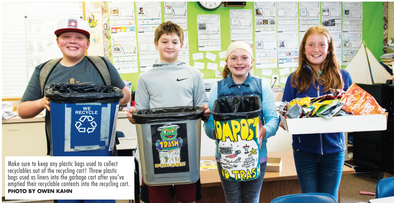
Make sure to keep any plastic bags used to collect recyclables out of the recycling cart! Throw plastic bags used as liners into the garbage cart after you've emptied their recyclable contents into the recycling cart.